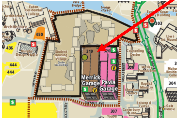
Electric Vehicle Charging Station Located at Merrick Garage